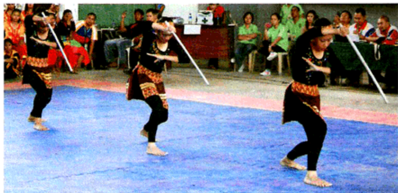
Region XII Arnīs Secondary Girls in their performance in the Synchronized Solo Baston.

Just like their male counterparts, they are also determined to sweep five gold medals in the full contact labanan to start this day. (HST)